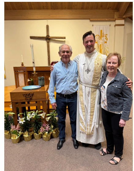
Member for 50 Years