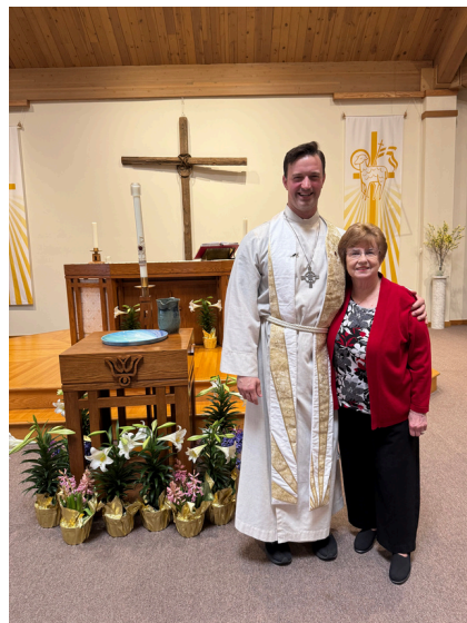
Member for 50 Years