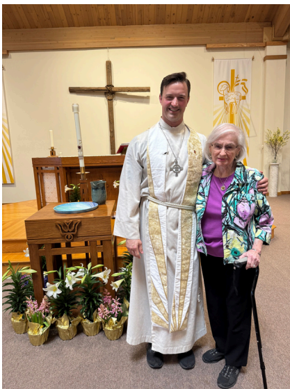
Member for 53 Years